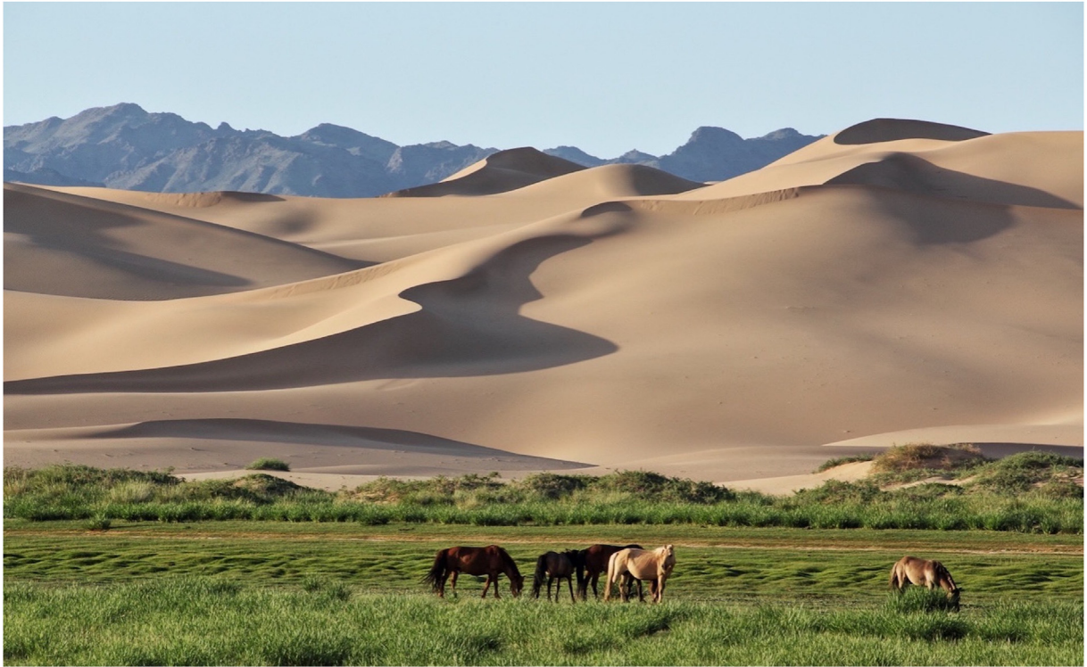
Figure 6. The Khongoryn Els sand dunes at Gobi Gurvan Saikhan National Park exhibit exceptional eolian features for a desert landscape.