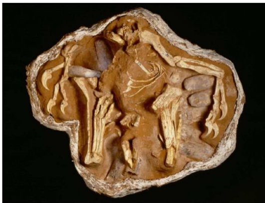
Figure 3. A fossilized oviraptor ( Citipati osmolskae ) on its nest found at the Flaming Cliffs.

Mediterranean (Honeychurch 2017). The complex network of nomadic tracks that crisscrossed the Gobi later formed the network of ancient caravan routes that linked up with the Silk Roads of China allowing for the transmission of commercial goods and sociocultural and religious ideas between Mongolia and its neighbors (Frachetti et al. 2017). Tibetan Buddhism, which spread across these Inner Asian tracks in the 13 th century, flourished in the Gobi landscape; hundreds of monasteries and temples were built in the desert by the 18 th century (Documentation of Mongolian Monasteries 2022). Evidence of the Gobi as a spiritual landscape can be traced back to an even more ancient past. Oboos , a rocky cairn structure used to mark sacred territories, still dot hilltops and mountain ranges, indicating that the Gobi has long been a sacred and spiritual landscape in ancient Mongolian cosmology (Dal Zovo et al. 2014).