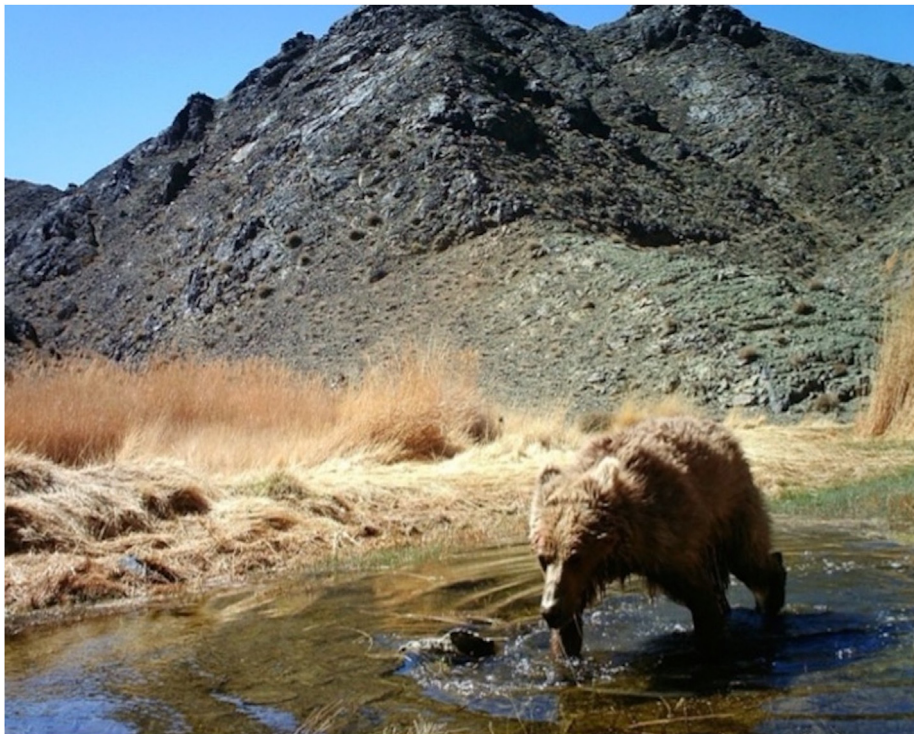
Figure 9. The Great Gobi SPA is a critical habitat for several endangered animals including the Gobi bear ( Ursus arctos gobiensis ) for which only around 30 adults are known to exist.

pastoralists. Desertification, the result of a multiplicity of factors, including overgrazing of livestock and climate change, is accelerating the spread of the Gobi Desert, making it the fastest growing desert in the world, and contributing to environmental