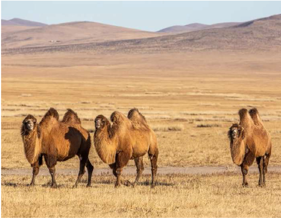
Figure 10. The size of the Great Gobi SPA serves as an important wildlife corridor and transit zone for important populations of migratory ungulates such as the wild Bactrian camel ( Camelus ferus ).