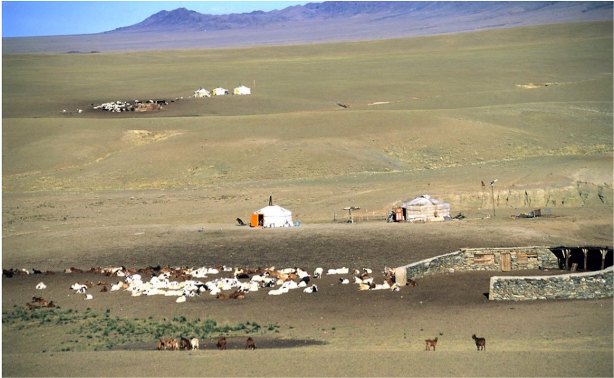
Figure 8. Traditional nomadic life is still practiced within Gobi Gurvan Saikhan National Park.