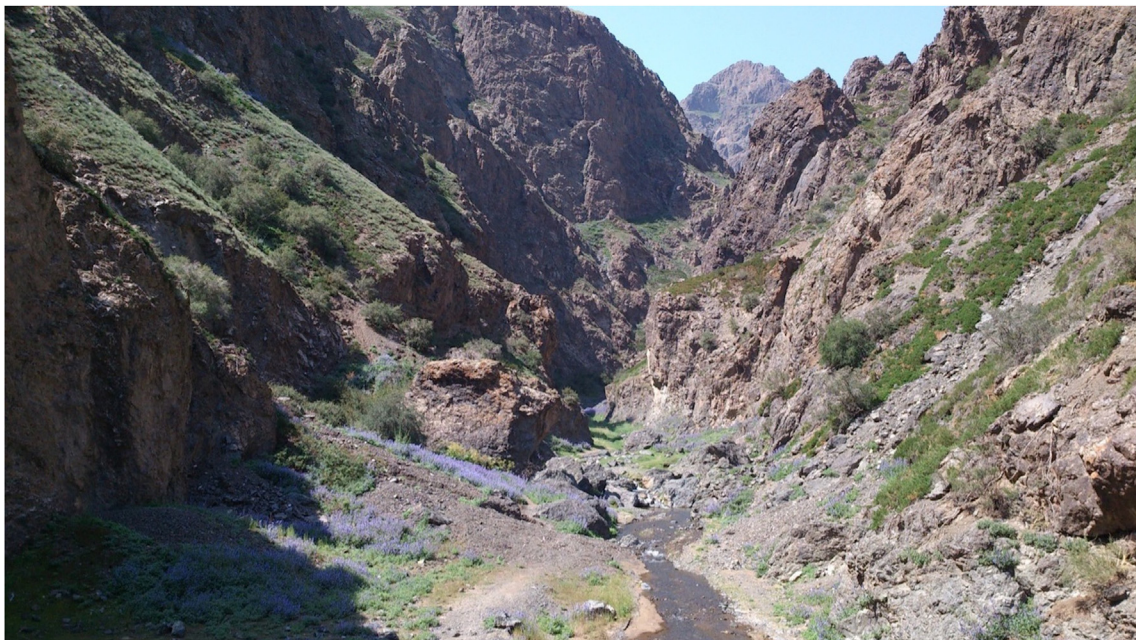
Figure 5. Yolyn Am gorge at Gobi Gurvan Saikhan National Park. In years past the ice field at Yolyn Am remained year-round, however because of climate change, the ice tends to disappear by September.

presents an urgent threat for migratory species as transportation infrastructure fragments environments and creates barriers to movement (Enkhjargal 2021). Complaints about mining's disproportionate use of water in the Gobi are commonplace, and many nomadic families protest that their livelihoods are at risk. Oyu Tolgoi, one of the world's largest gold and copper mines