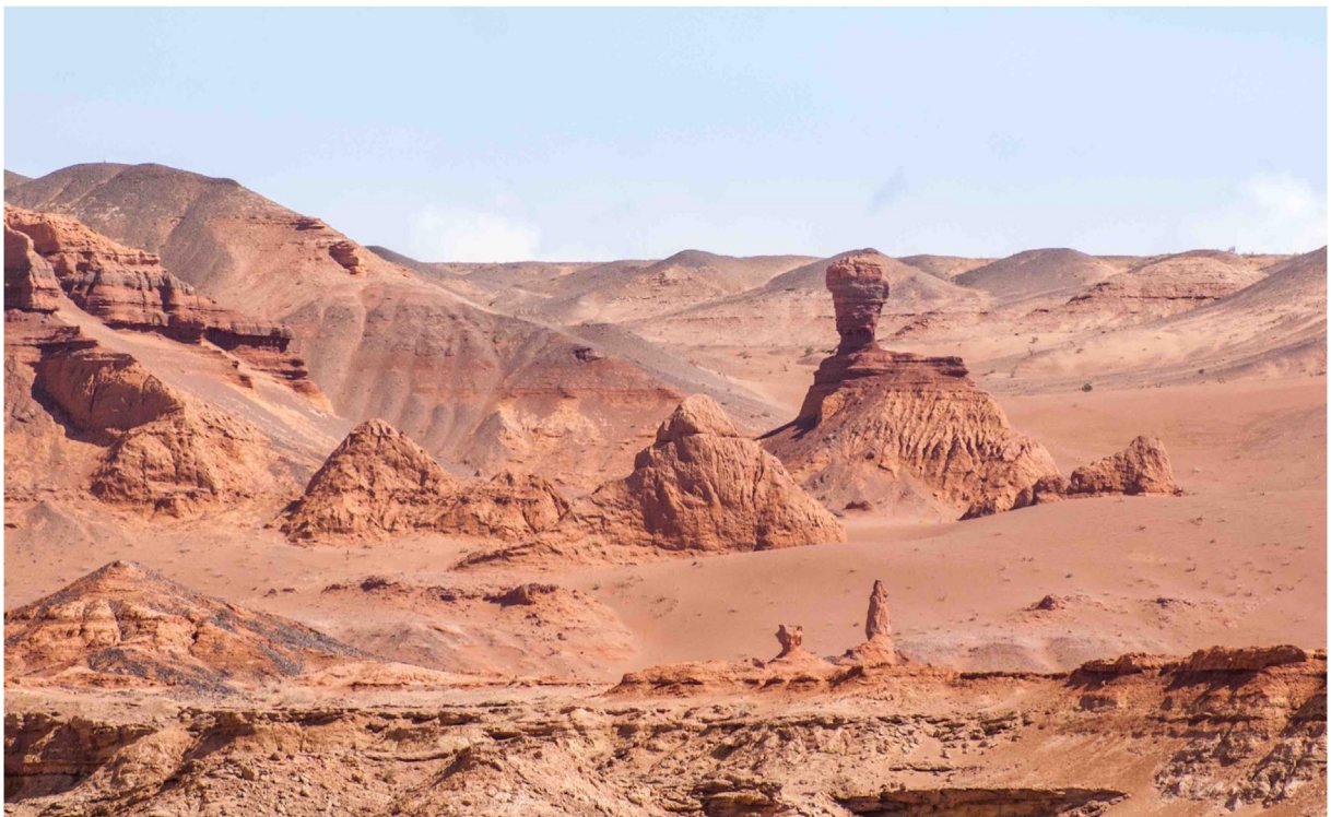
Figure 7. Khermen Tsav in Gobi Gurvan Saikhan National Park contains some of the largest and best developed weathering features in the Gobi.

compounded by the threat of climate change – the Gobi is a climate hotspot – accelerating faster than elsewhere (Sternberg et al. 2015). Extreme weather events including prolonged