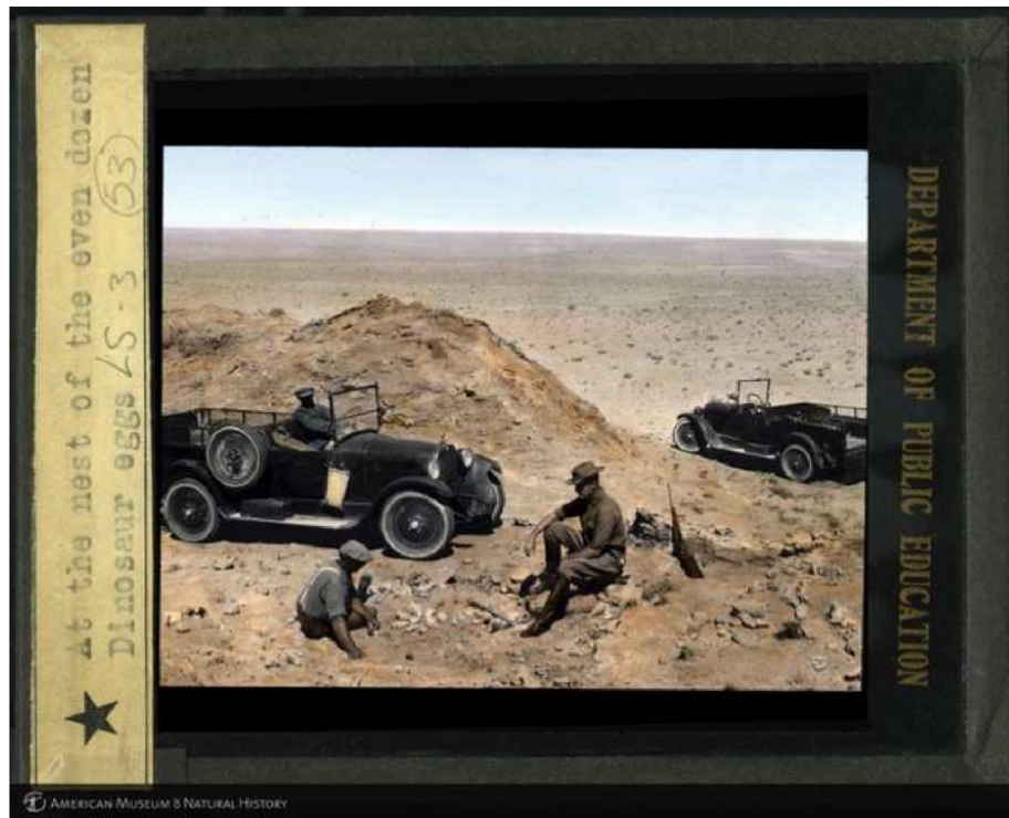
Figure 2. Roy Chapman Andrews at the nest of an Oviraptor.