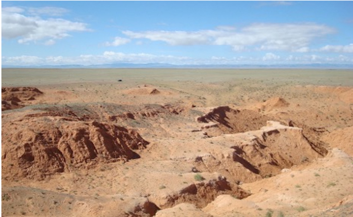
Figure 4. The Flaming Cliffs (Bayanzag) in Omnogobi Province, south Mongolia. The surrounding areas are a distinctive Gobi landscape and remain of pristine environmental quality with limited impairment or human interference.