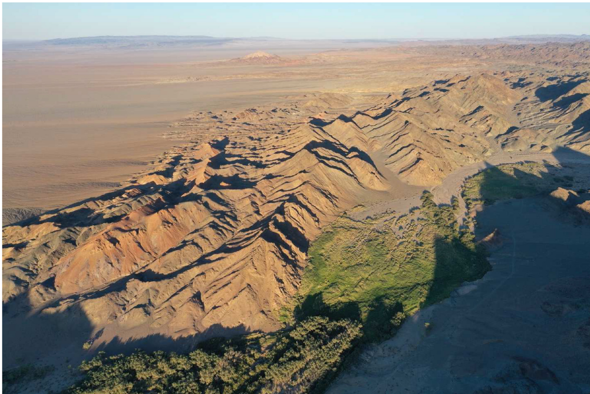
Figure 11. Shar Khuls Oasis in Great Gobi SPA A is a critical water source for many of the protected area's keystone species including the Gobi Bear ( Ursus arctos gobiensis ), wild Bactrian camel ( Camelus ferus ), Mongolia wild ass ( Equus hemionus hemionus ), and several bird species. The oasis also served as a resting point for caravans moving along ancient silk road tracks.