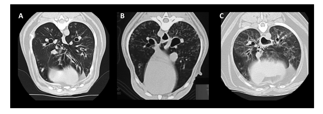
Fig. 1. Examples of three lung patterns on CT imaging. A: bronchial pattern in chronic bronchitis; B: interstitial pattern by diffuse granular shadows in diffuse panbronchiolitis; C: interstitial pattern by ground glass opacity with septal thickening in idiopathic pulmonary fibrosis.

a two-site sandwich ELISA were used. A standard curve was prepared using purified cSP-A [8, 13] from stocked BALF samples of clinically healthy dogs, which were used in a previous study [22]. In preliminary examination, this assay showed the detection limited of 3.1 ng/ml and the coefficient of variation of 1.28-8.92%. Furthermore, BALF and serum cSP-A concentrations in healthy adult dogs were 2,033 \pm 1,214 \text{ ng/ml} and 23 \pm 13 \text{ ng/ml} . In addition, BALF cSP-A concentrations were corrected by urea concentrations (QuantiChrom<sup>TM</sup> Urea Assay Kit, BioAssay Systems, Hayward, CA, U.S.A.) in serum and BALF [17].