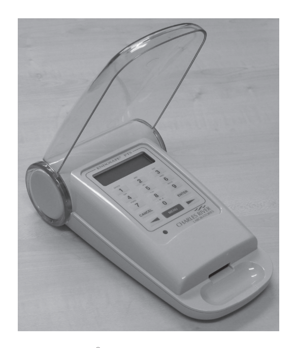
Fig. 1. The Endosafe® PTS system. Spectrophotometer and reader.

determined activities using a kinetic turbidimetric (KT) assay. In addition, a present study was verified whether PTS could measure the milk endotoxin activity of mastitis cattle caused by Gram-positive or negative bacteria.